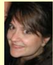
Spanish School Representative